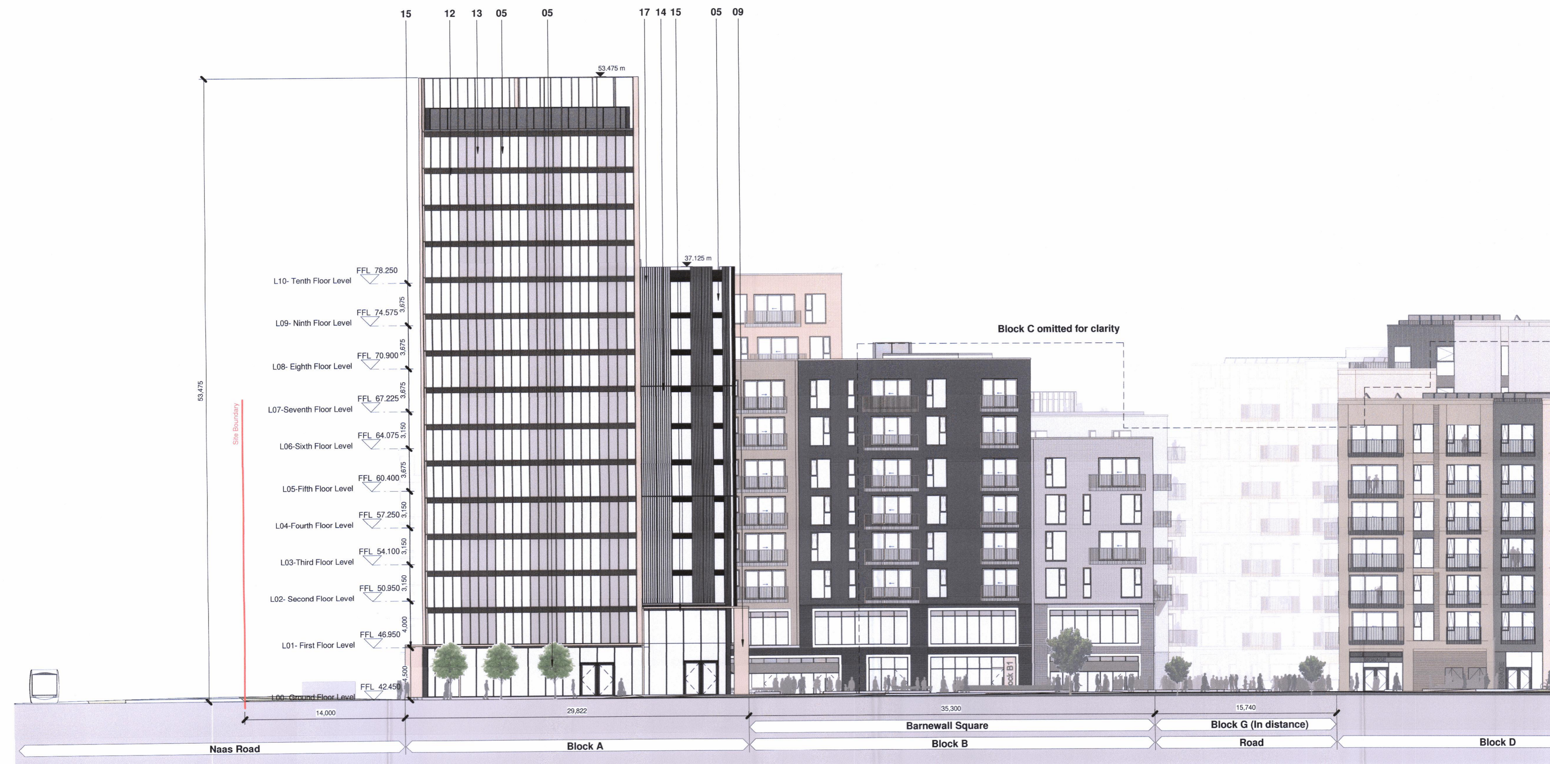
Block B - West Elevation - Walkinson Avenue 1 : 200

NOTE: SHADOWS INDICATED ON ELEVATIONS. THIS WILL CHANGE THE APPEARANCE OF THE COLOURS INDICATED ABOVE.