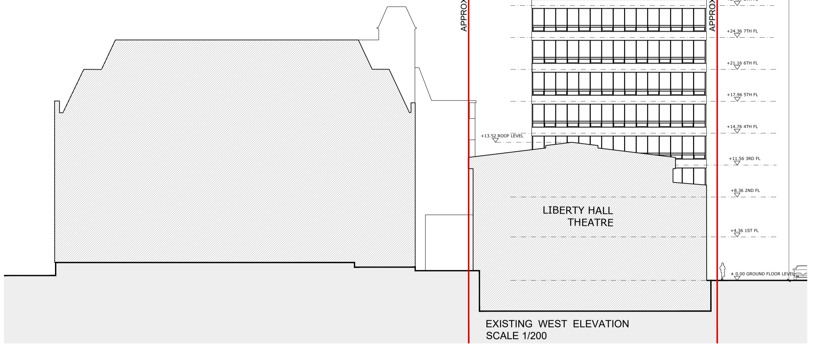
EXISTING WEST ELEVATION SCALE 1/200